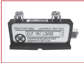
DLP Type MSB, LMSB, & L2MSB